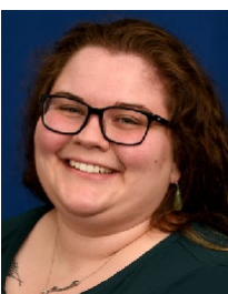
Georgia Crossway College Service Associate Academic Building AB113 gcrossway@mvcc.edu 315-792-5375